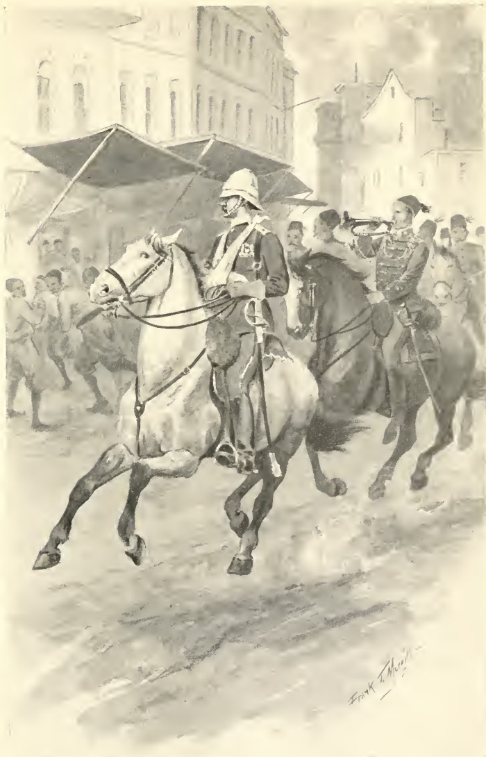
A TROOP OF TURKISH CAVALRY